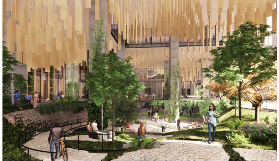
Top View of the Sunken Garden