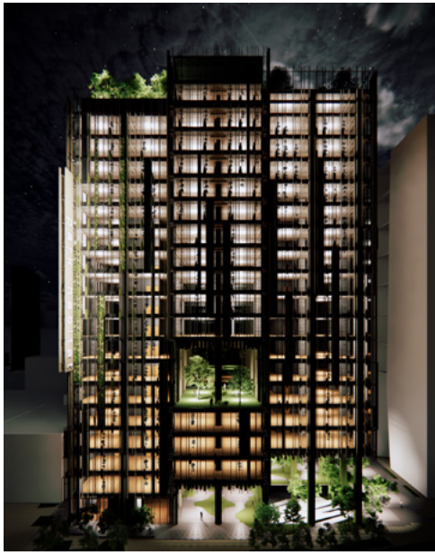
Night Aerial North View