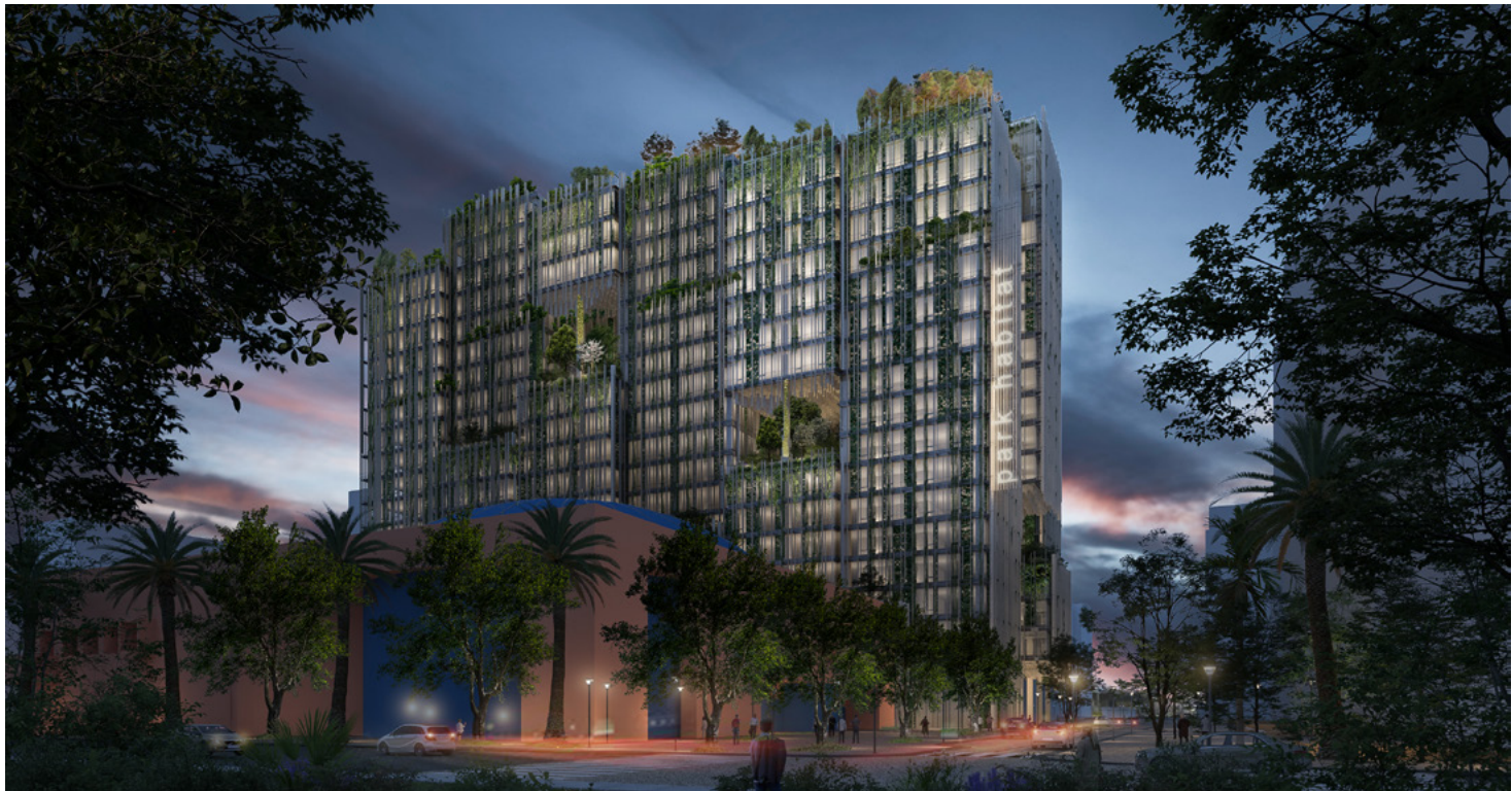
Bottom View of the Sunken Garden