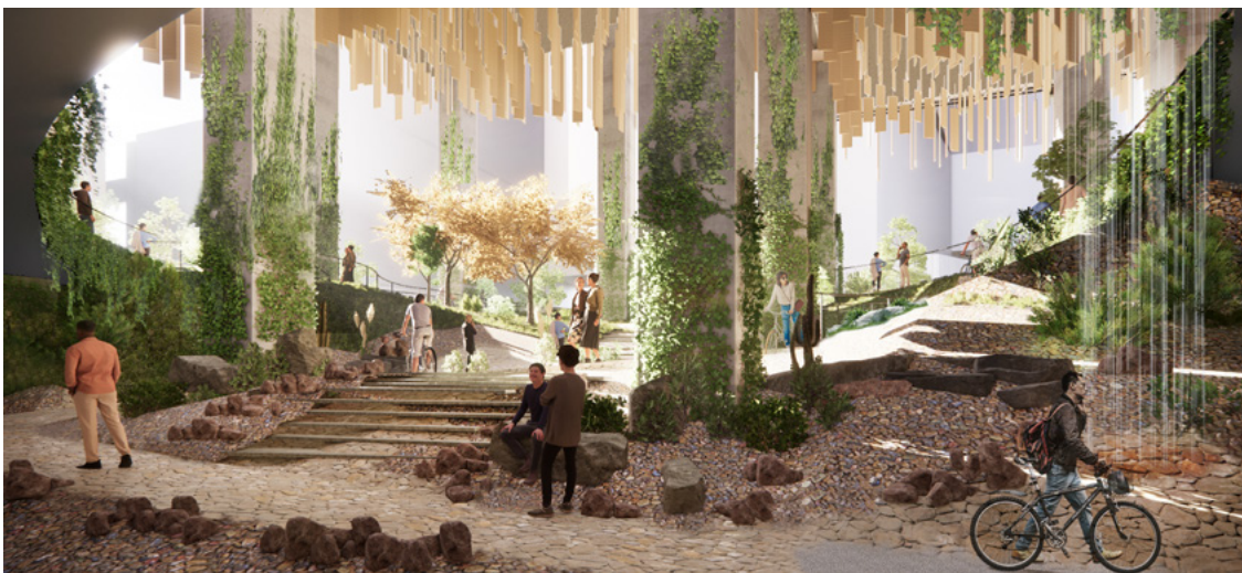
Bottom View of the Sunken Garden