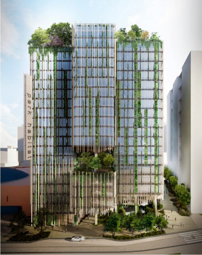
Day Aerial North View